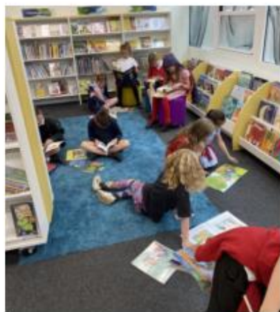
Regular trips to the library