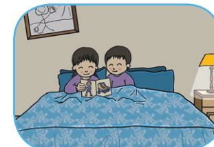
Read a bedtime story