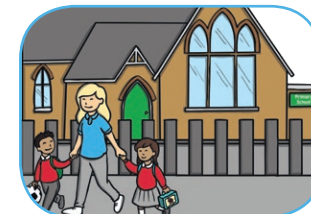
Come home from school